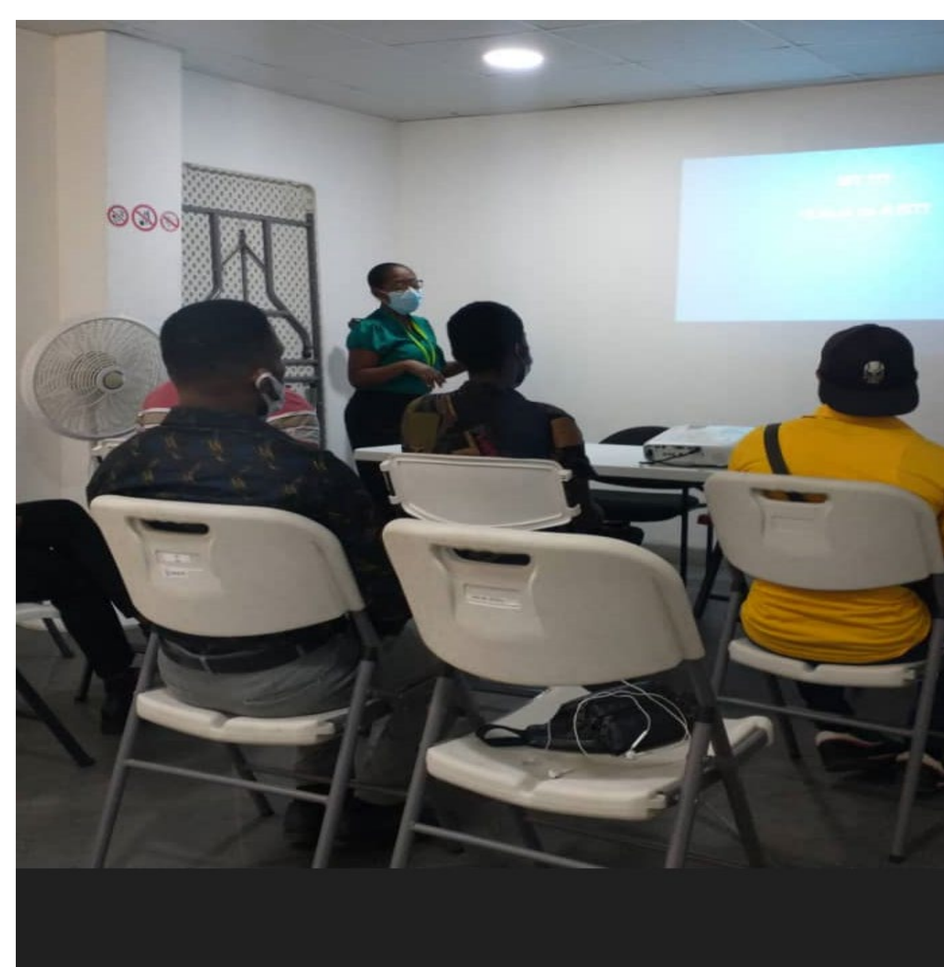
Fig. 3 : Orientation session for PrEP Champions

In May 2021, from a pool of clients already on PrEP at the men's clinic, three MSMs were selected for their communication skills and their adherence to both site visits and PrEP. They received an 8-hour training course using adapted versions of national curricula covering topics such PrEP, HIV and other STIs.