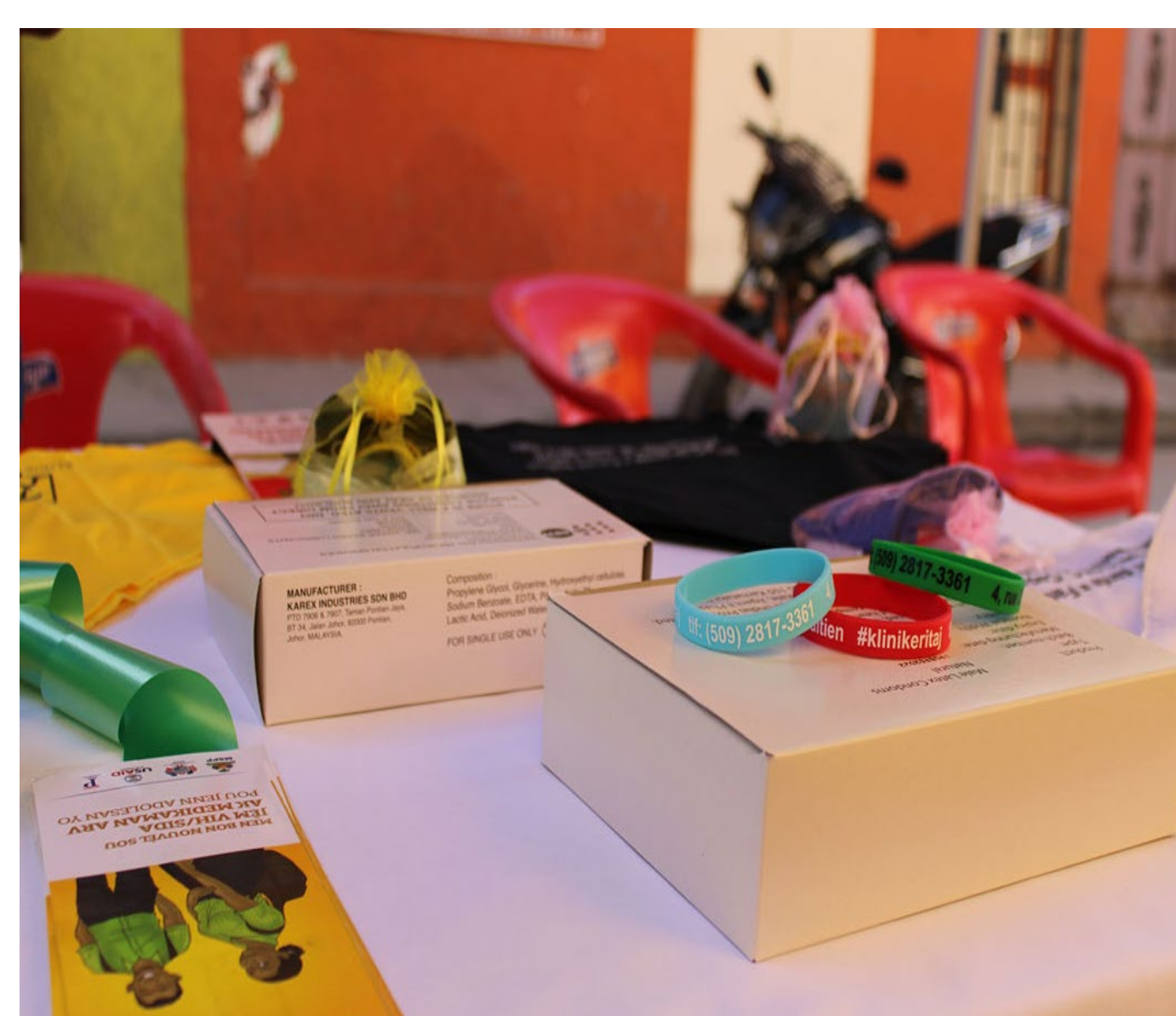
Fig. 2 : Sensitization material for client education

To increase client enrollment on PrEP especially in the MSM population, we adopted a peer led approach using MSM clients as PrEP champions.