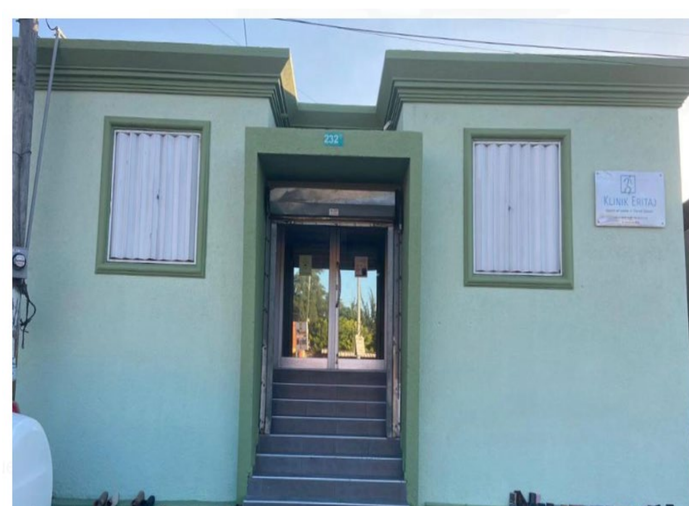
Fig. 1: Klinik Eritaj Ouest Men's Clinic

Through USAID funding, ISPD implemented a men's clinic where PrEP was included as part of a comprehensive and complete package of HIV prevention, care and treatment in March 2020.