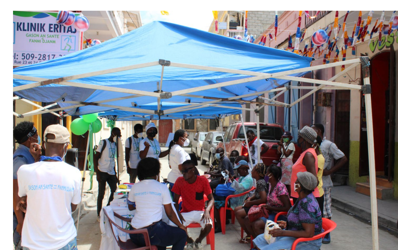
Fig. 4 : Community mobilization

The PrEP champions were to report to the site twice weekly for onsite patient education and client referrals.